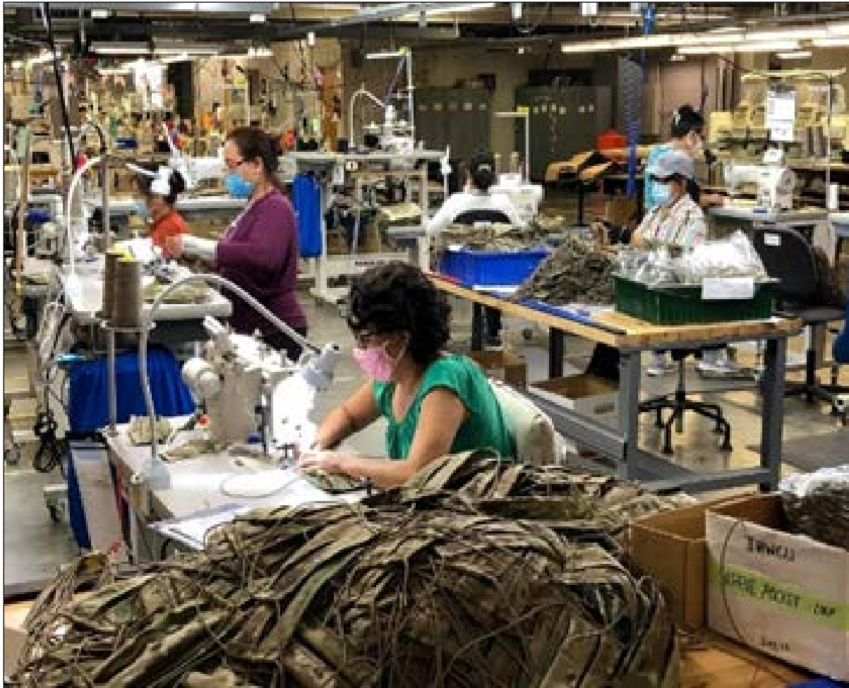
Industries of the Blind, in Greensboro, N.C., is among the nonprofit agencies manufacturing masks.