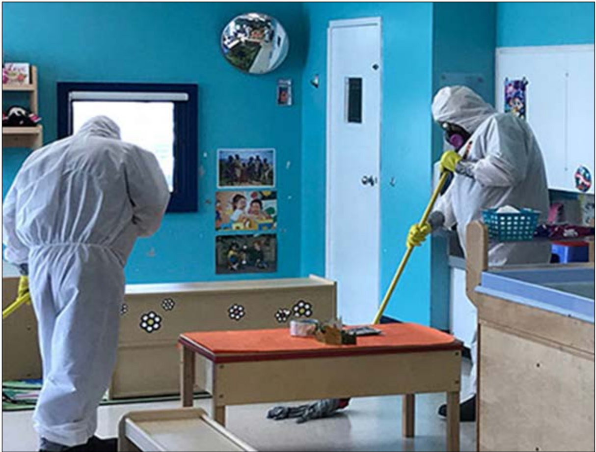
Employees at TRDI, in San Antonio, are among those performing essential janitorial services for Federal agencies including GSA and the Dept. of Homeland Security.